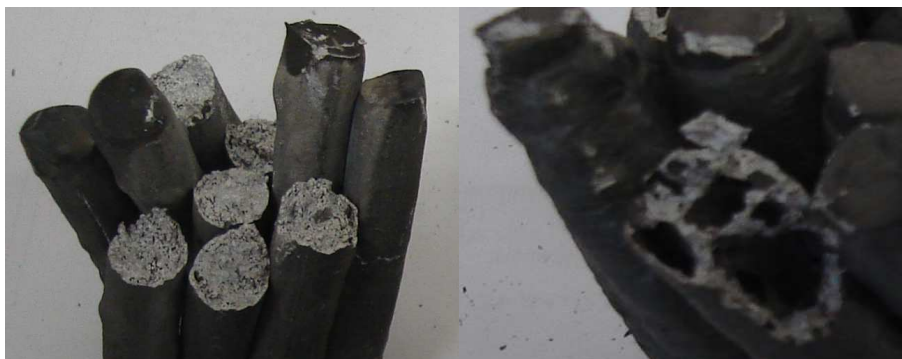
Fig. 3 Samples of AMC/SiC composite after heating on air for 4 hours at a) 650 °C (left) and b) 850 °C (right)

While temperature of 650 °C is close to melting point of aluminum, temperature of 850 °C used for another heating is well above it. Aluminum is not completely molten in case of temperature of 650 °C, so interaction between matrix and SiC particles is limited to the interface only. This causes brittleness of material, Al/SiC interface is not strong and elastic enough to provide material with sufficient tensile properties.