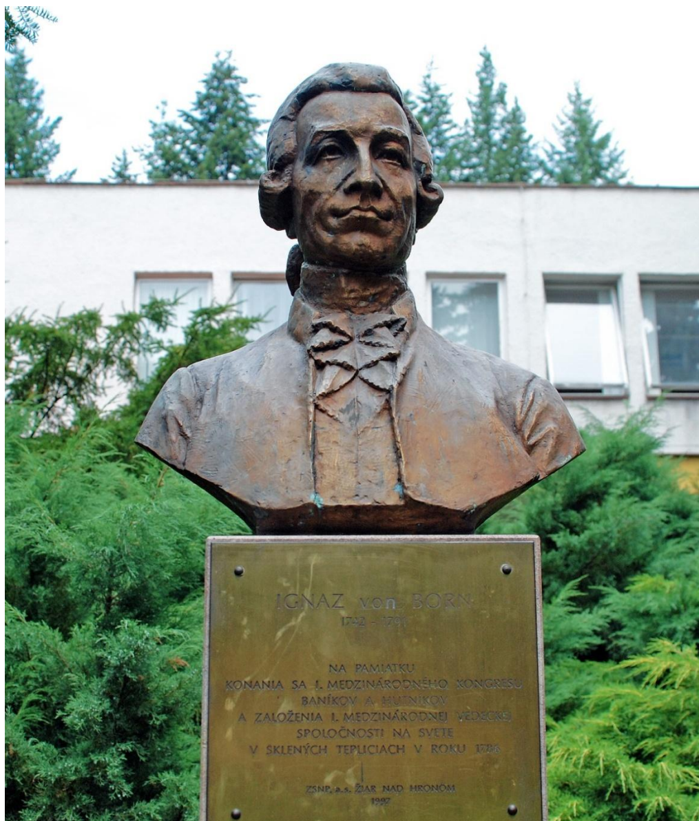
Fig. 6 Bust of Ignaz Anton von Born in Sklené Teplice (Slovakia)

Born's method was laboratory tested and refined by A. L. Ruprecht in a new laboratory in Banská Štiavnica (in Belházy's House) ( Fig. 7 ). The refinement consisted in increasing of extraction of precious metals (gold and silver), which was reached by rough crushing and fine grinding of the ore and followed by double sulphatizing roasting of the ore, where the second roasting was performed with the addition of salt. This method also contributed to the reduction of water consumption, wood burnt and to shortening of the entire process. A. Ruprecht deserved most of the credit that Born's amalgamation was successfully implemented into practice. He selected Sklené Teplice for a production facility where a suitable object of the shutdown