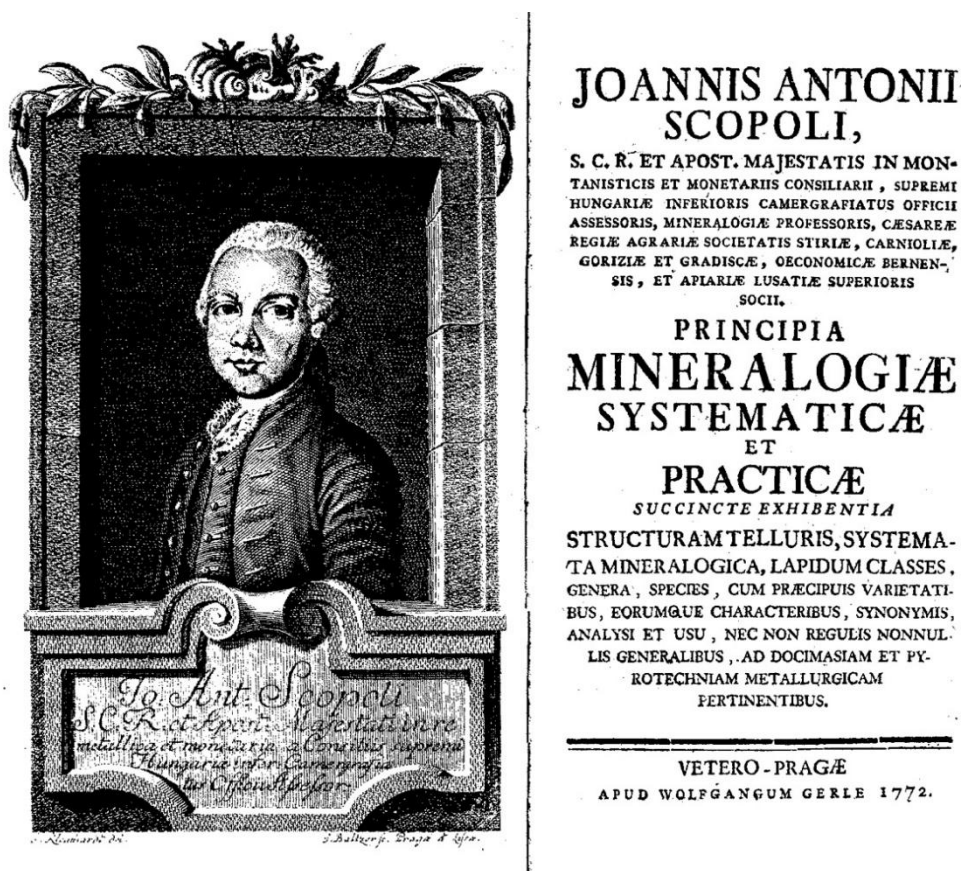
Fig. 2 Giovanni Antonio Scopoli (portrait on the title page of his monography “Principles of Systematic and Practical Mineralogy“

He followed the successful activities of his predecessor, paying special attention to the research of silver ores and minerals particularly from the region of the central Slovakia – assessing their shape, physical and chemical properties, where he admiringly depicted the beauty and diversity of crystals from Schemnitz mines. He continued in completing a mineralogical collection; in teaching activities he put the emphasis on problems of mining and metallurgic mineralogy. Scopoli's mineralogical work has the key priority in the history of mineralogy in both Slovakia and Europe. During his work at the Academy in Banská Štiavnica, he did not confine himself only to chemical-metallurgical and geological-mineralogical research. Of particular importance is also his 5-volume botanic-faunistic monograph Anni Historico Naturales (1769 - 1772; Leipzig), in which he provided description of plants and animals located in the area of Banská Štiavnica already according to the system of Carl Linnaeus. Some genera and subgenera are even named after Scopoli, including a known alkaloid scopolamine. In 1777 he accepted professorship of botany and chemistry at the University of Pavia, where he remained for the rest of his life [10, 15 – 18].