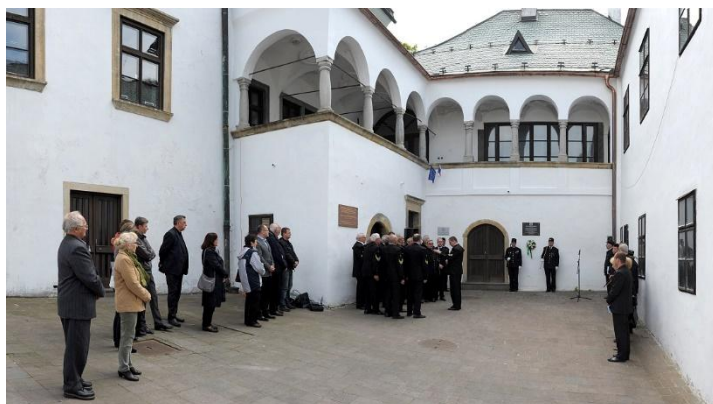
Fig. 7 Belházy's House in Banská Štiavnica

smelting plant was located and nearby there were also deposits of silver ore. The new method showed a great deal of interest abroad. Born invited to the public demonstration of his method the metallurgists from the whole Europe. This event impressed particularly Spaniards, as the original procedure of amalgamation was a lengthy process with large losses of mercury. This immense interest eventually resulted in the decision to organize an international gathering of experts – Congress at Skleno (present-day Sklené Teplice) [36].